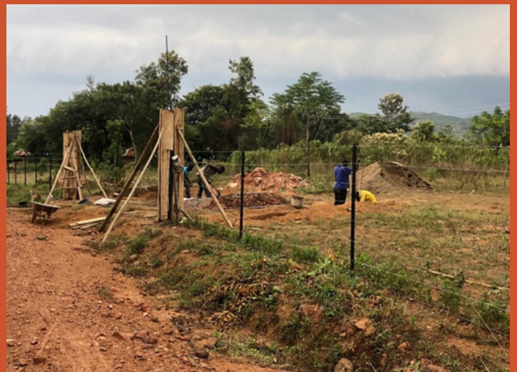
Sijowa Community Library Site Photos